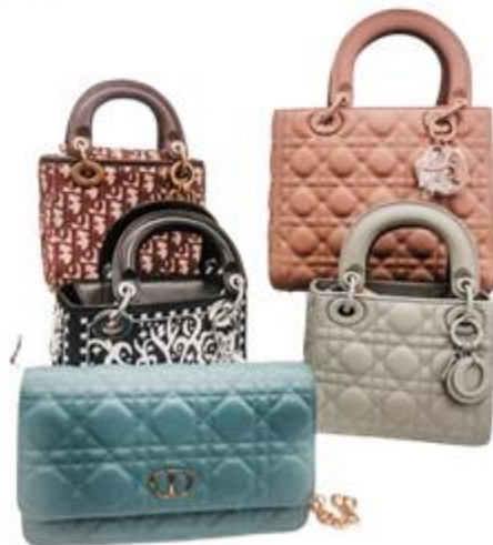
2 new bags