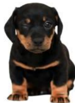
3 a cute dog