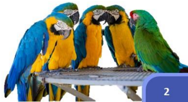
4 colorful parrots