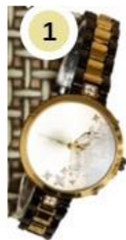
an expensive watch