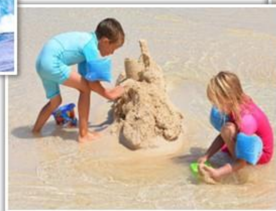
make a sandcastle