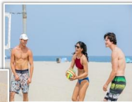
play beach volleyball