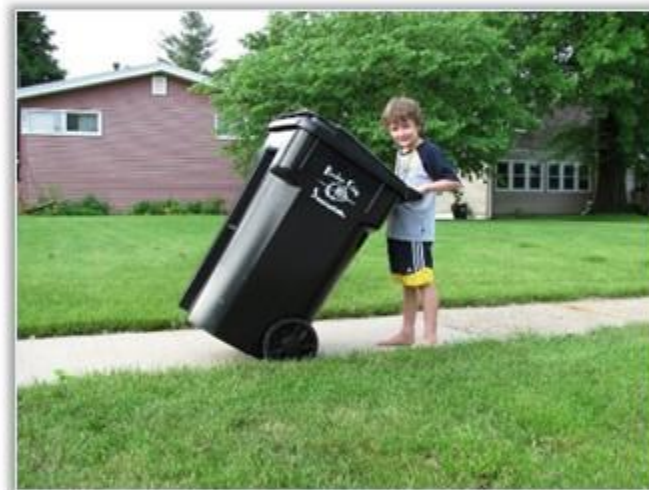
take out the trash