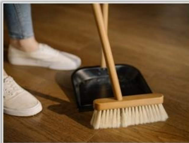
sweep the floor