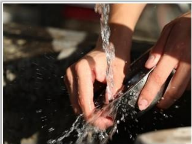
do the dishes