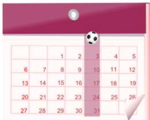
once a week