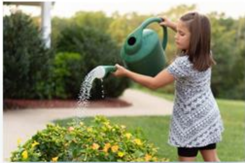
watering the flowers