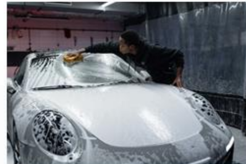
washing the car