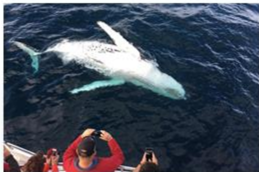
go whale watching