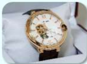
Cartier = $20,000