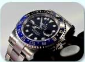
Rolex = $20,000