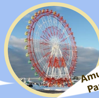
Amusement Park Rides