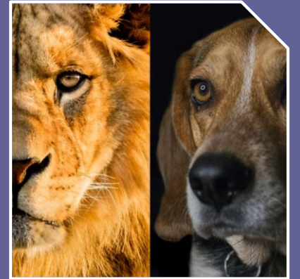
Animals and Pets