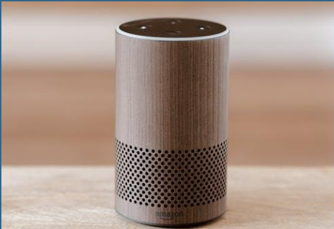
Digital Voice Consultant