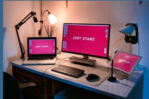
Smart Home Devices