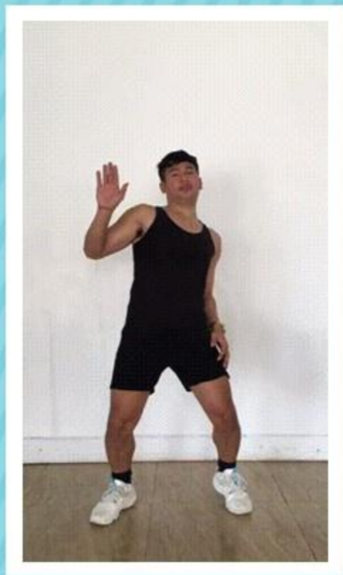
the whip/ nae nae