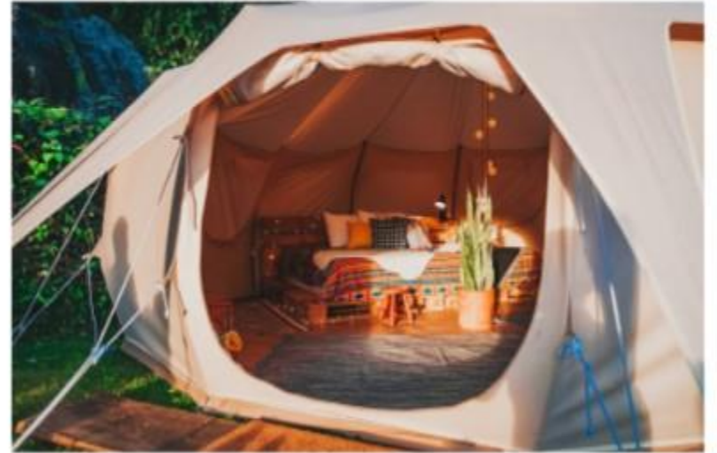
glamping (glamorous camping)