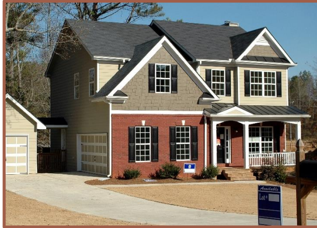
living in a normal house