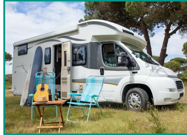
living in an RV (Recreational Vehicle)

Do you like living in an RV? Everyone has their own answer. I think living in a normal house is _____ than living in an RV. However, living in an RV is _____ than life in a normal house! I prefer to live in a _____.