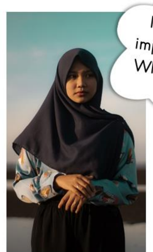
Is appearance important to you? Why or why not?