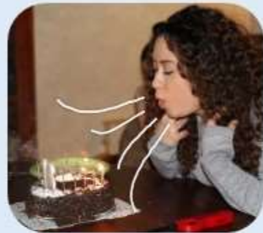
in one breath = one straight blow

The birthday cake has also become a symbol of love. Everyone can get a slice . People gather together to celebrate and to have a good time. Again, the birthday person needs to cut the first slice for good luck.