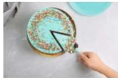
slice = a piece of cake that has been cut from a larger cake