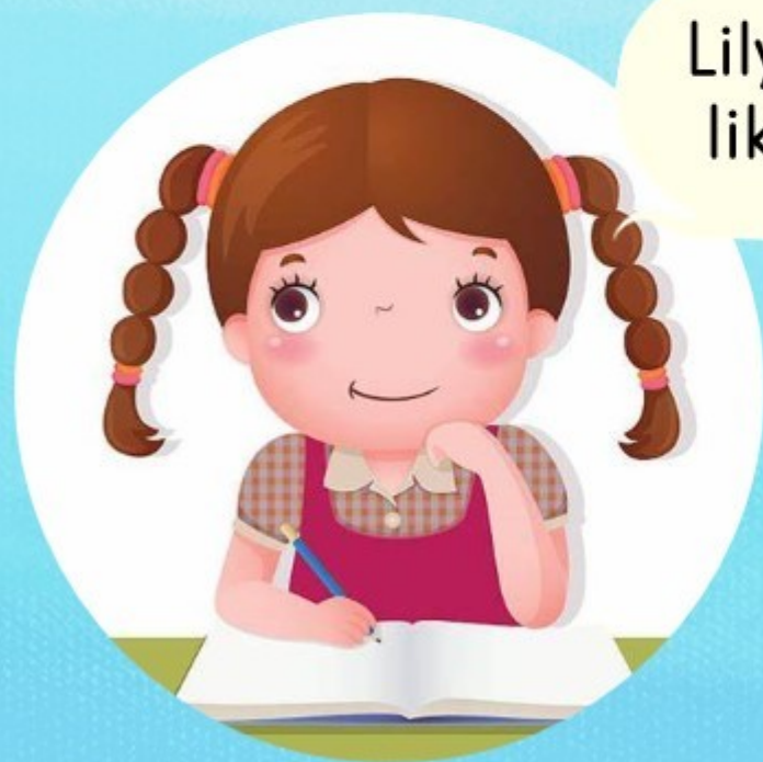
Lily's Order Chart